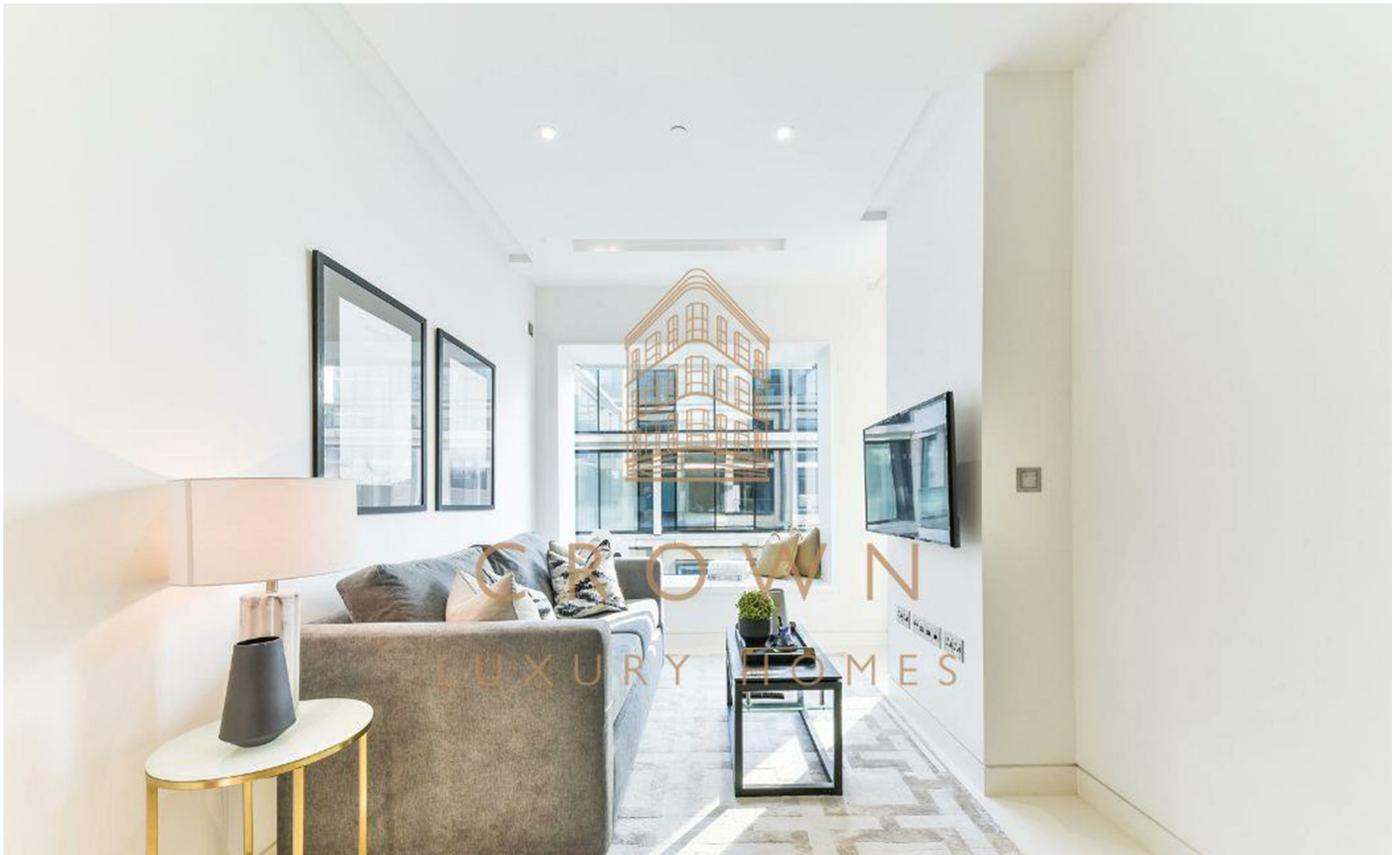
Flat 97, 1, Sugar Quay Water Lane, London, EC3R 6AP £3,500